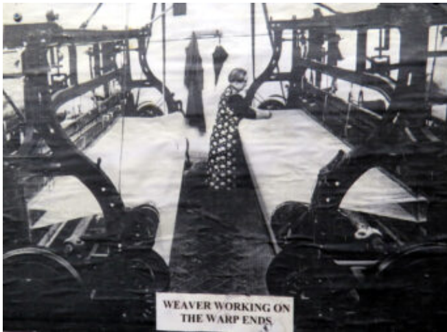
The old Machines