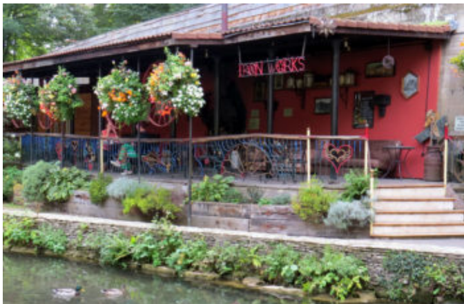
Egypt Mill Terrace