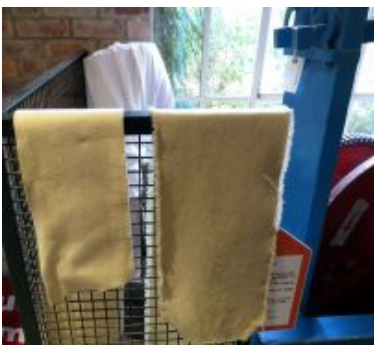
Pre and post finishing