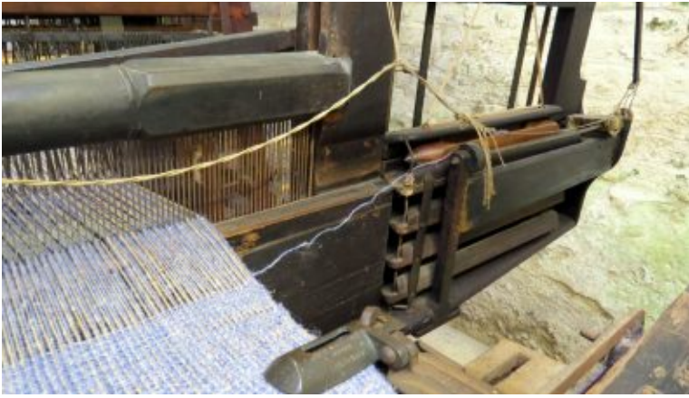
The Flying Shuttle