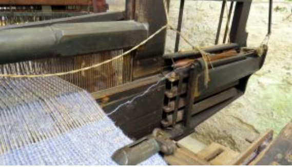
The Flying Shuttle