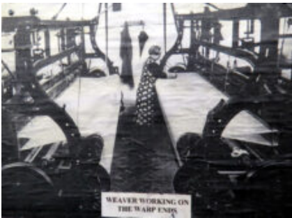
The old Machines