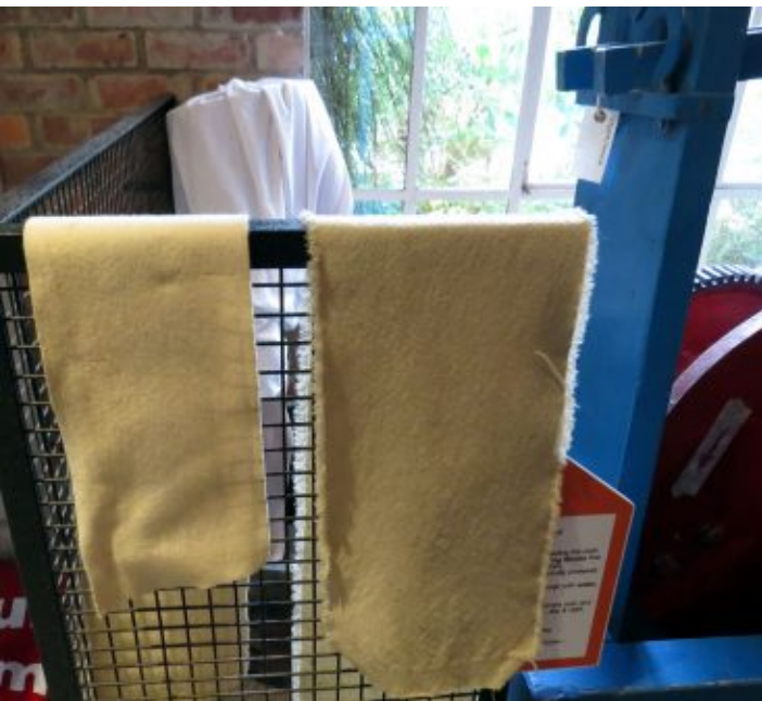
Pre and post finishing