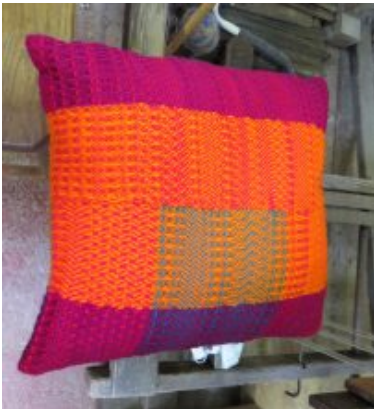
Woven fabric Pillow