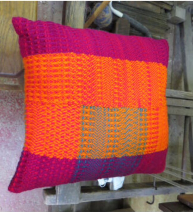
Woven fabric Pillow