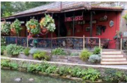
Egypt Mill Terrace