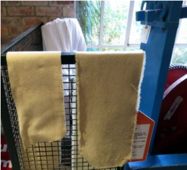
Pre and post finishing