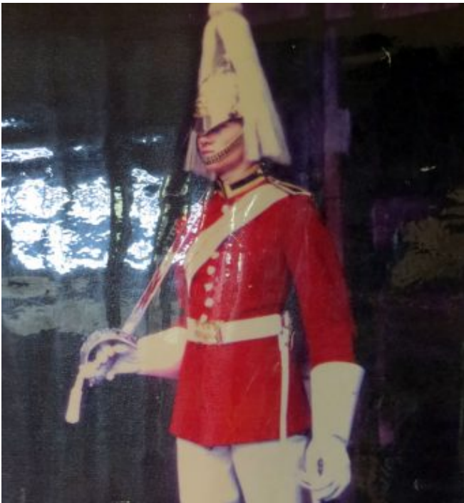
Cloth in Action