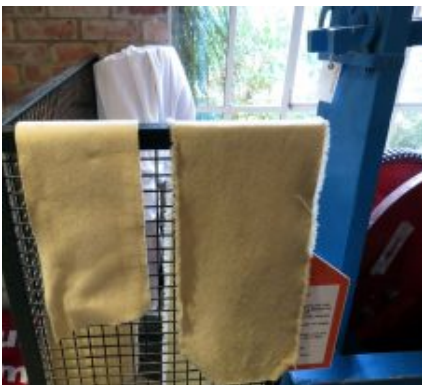
Pre and post finishing