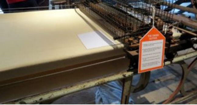
Shearing the Cloth