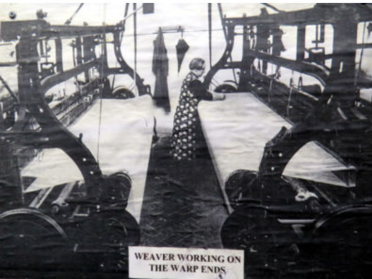
The old Machines