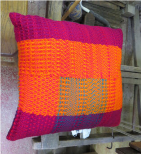
Woven fabric Pillow