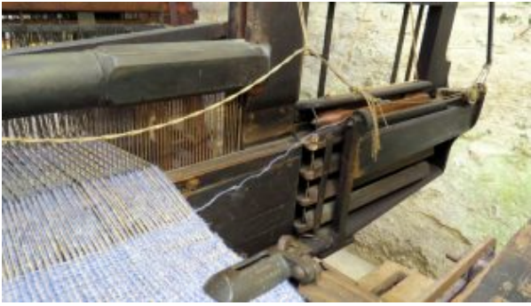
The Flying Shuttle