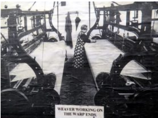
The old Machines