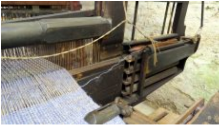
The Flying Shuttle