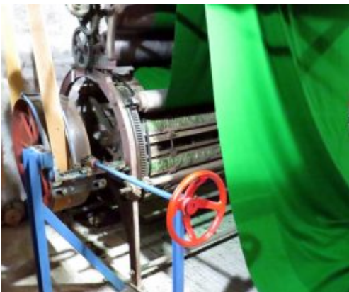
Raising the Cloth