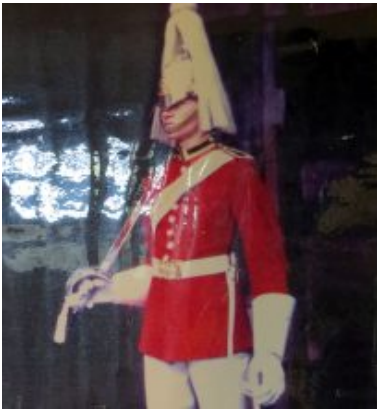
Cloth in Action