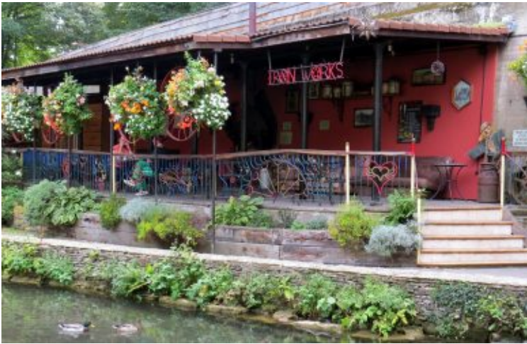
Egypt Mill Terrace