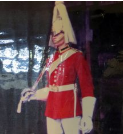
Cloth in Action