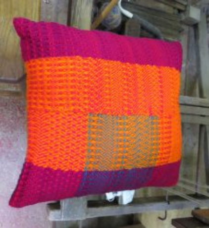
Woven fabric Pillow