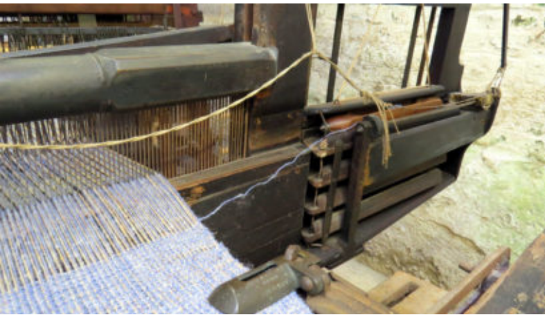
The Flying Shuttle