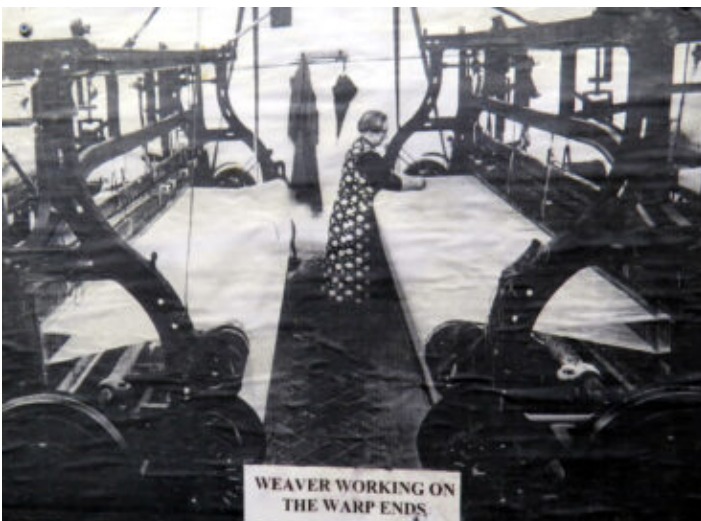
The old Machines