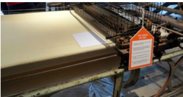
Shearing the Cloth