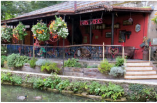
Egypt Mill Terrace