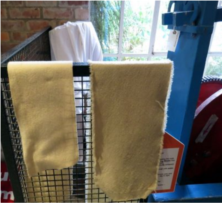
Pre and post finishing