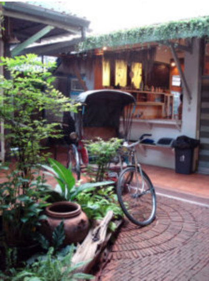
Old tuk tuk

and enough to keep you or the kids busy.