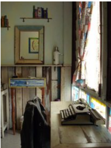
Oozing charm i