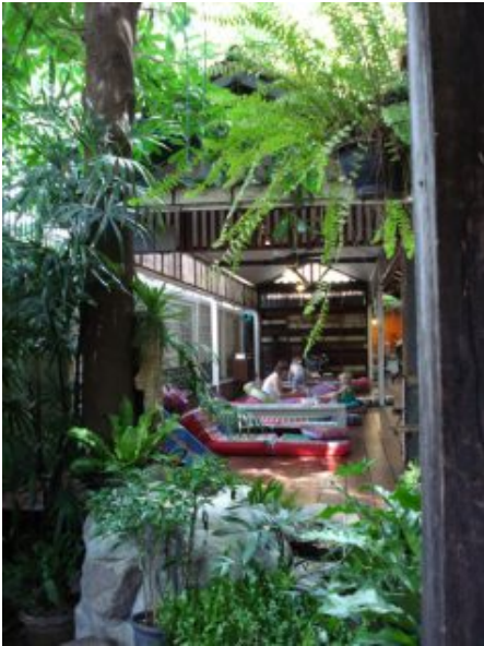
The oasis garden