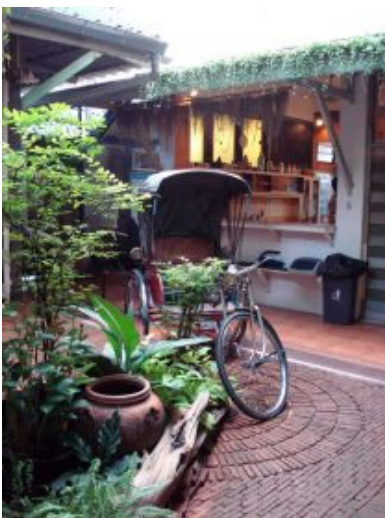
Token tuk tuk