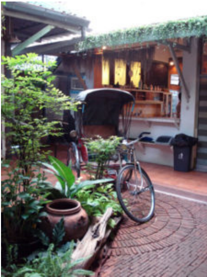
Old tuk tuk

and enough to keep you or the kids busy.