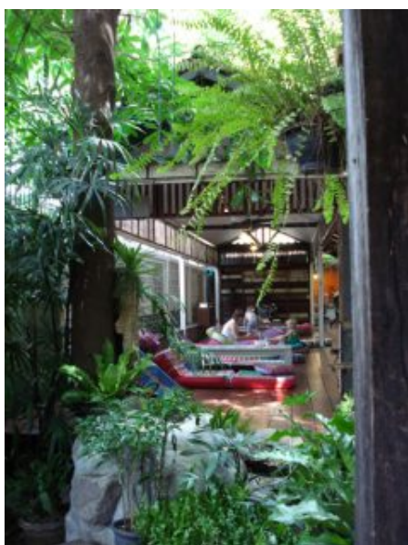
The oasis garden

http://www.phranakorn-nornlen.com/ even their site is cute ☺