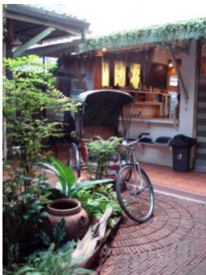
Old tuk tuk

While my all time favorite part of staying at Phranakorn Nornlen is that they also do creative workshops; tie-dye, stamping, sewing or cooking. They have a timetable, pricing and enough to keep you or the kids busy.