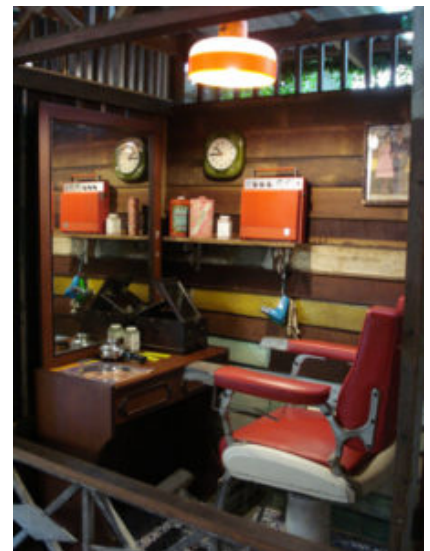
Visit the barber shop

It is located not too far from Kaosan road, which is a short 10 minutes walk wat – yet it's far enough away to avoid being touristy. Everything from the divine ginger tea, mouthwatering food, hangout area and small design details are beyond words.