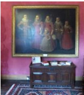
Bloody Mary's Room, Hellens Manor