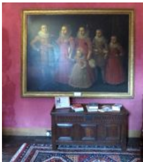
Bloody Mary's Room, Hellens Manor