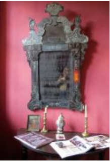
Bloody Marys Room