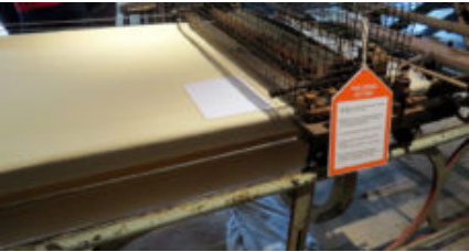
Shearing the Cloth