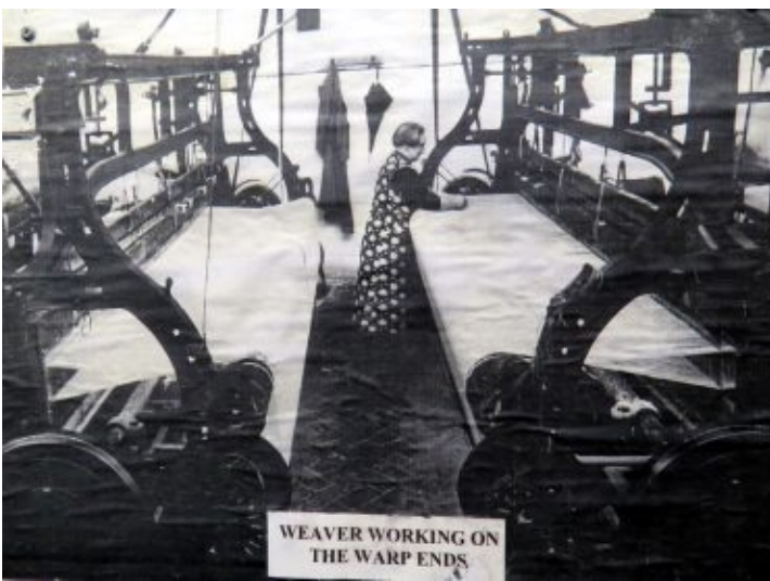
The old Machines