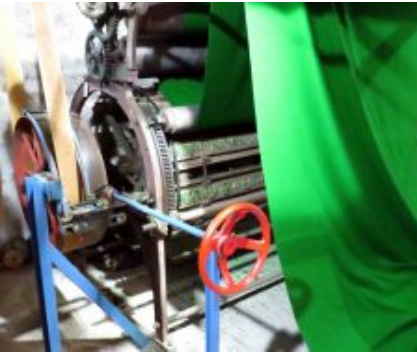
Raising the Cloth