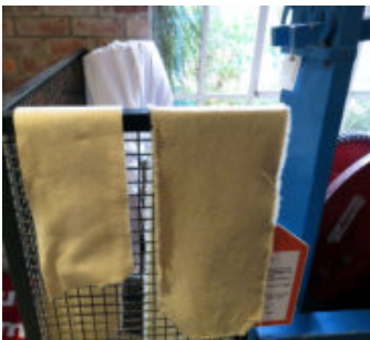
Pre and post finishing