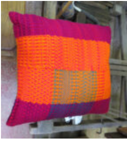
Woven fabric Pillow