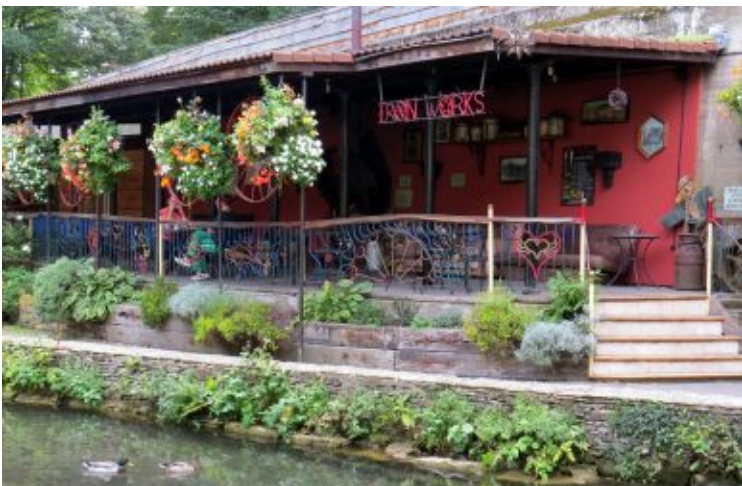
Egypt Mill Terrace