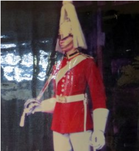
Cloth in Action