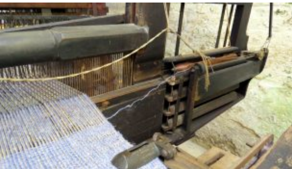
The Flying Shuttle